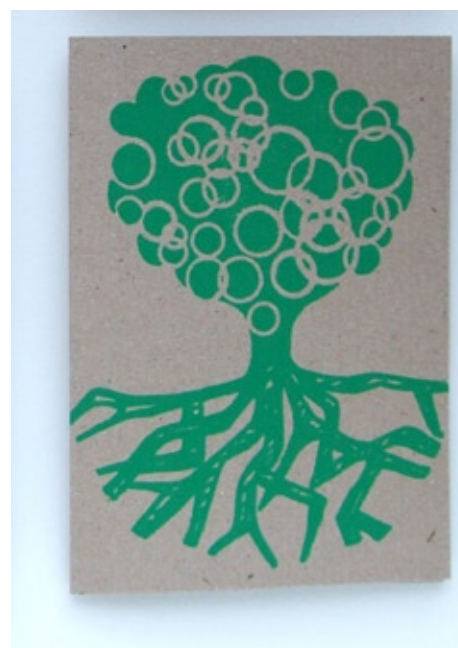
Circle Tree Available in Yellow, Orange, Blue, Green