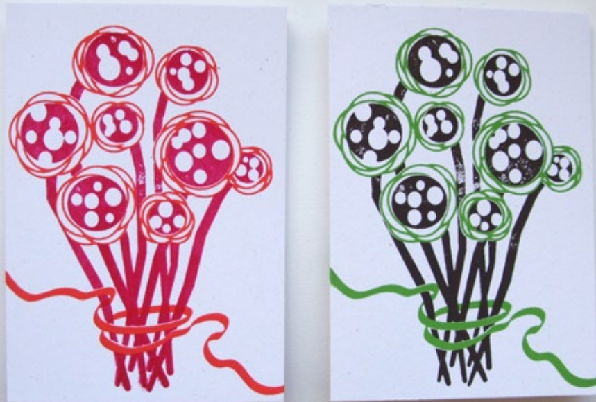
Flower Posy Available in Pink/Orange or Green/Chocolate