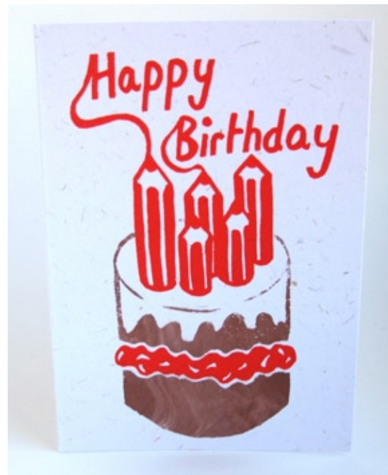
Happy Birthday Cake Available in Red or Purple