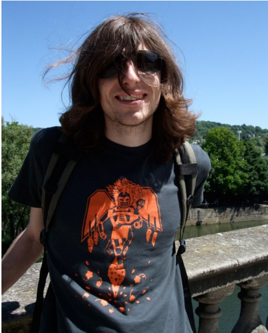
Robotticelli Available for Men and Women £10.00 Small, Medium, Large (Women's T-Shirts are fitted)

Our designs are quirky, playful and original. Organic Cotton T-shirts have been chosen for their super soft feel and low carbon footprint.