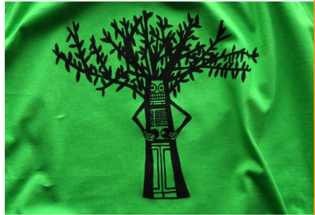
Robo-Tree Available for Men and Women £10.00 Small, Medium, Large (Women's T-Shirts are fitted)