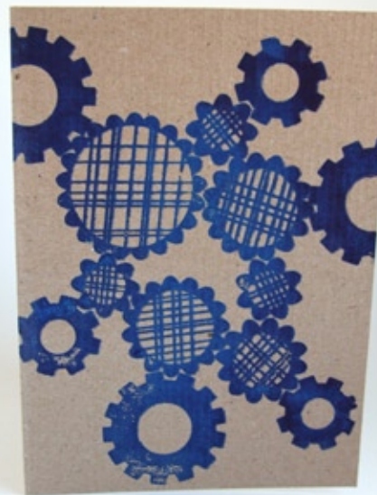
Cogs and Flowers Available in Yellow, Pink, Blue, Green