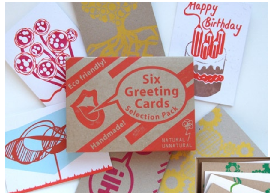
Selection Pack (6 Cards) £5.00