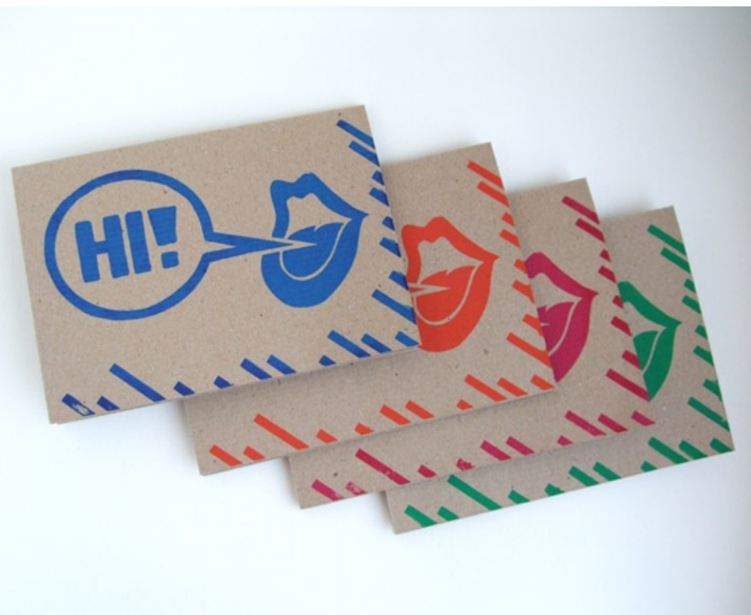
Hi! Available in Orange, Pink, Blue, Green.

Superior recycled card has been selected due to its quality and tactile properties. We screen print each design by hand using solvent free inks. Each card and envelope is protected in a biodegradable display bag.